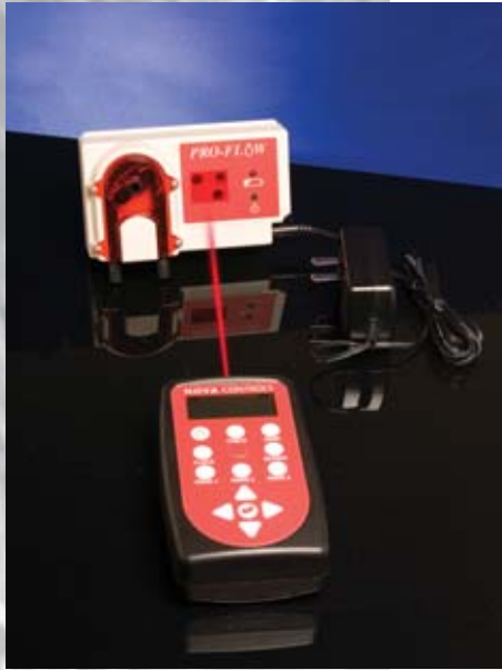
Pro-Flow Dispenser with Wall Transformer and Handheld IR Remote Programmer