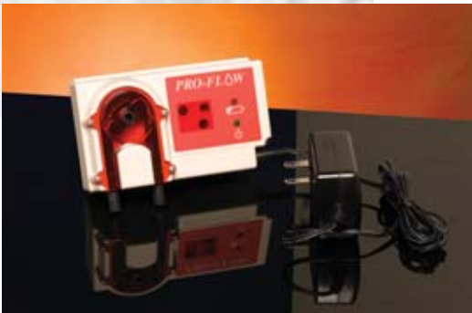
Pro-Flow Dispenser with Wall Transformer

Install Pro-Flow indoors on a vertical surface or product container lid. After installation, the customer experiences hands-free dispensing and can view two LEDs with universal icons for POWER-ON and LOW BATTERY .