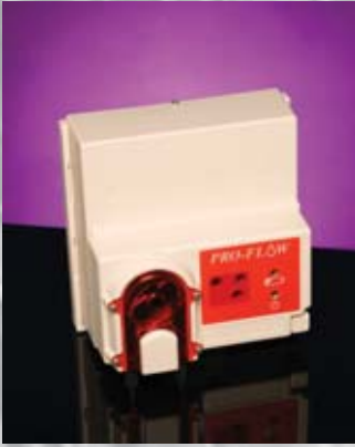
Pro-Flow Dispenser w/ Battery Pack